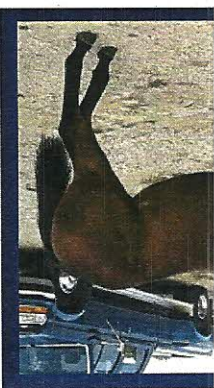
Type of Registration CROSS-BRED